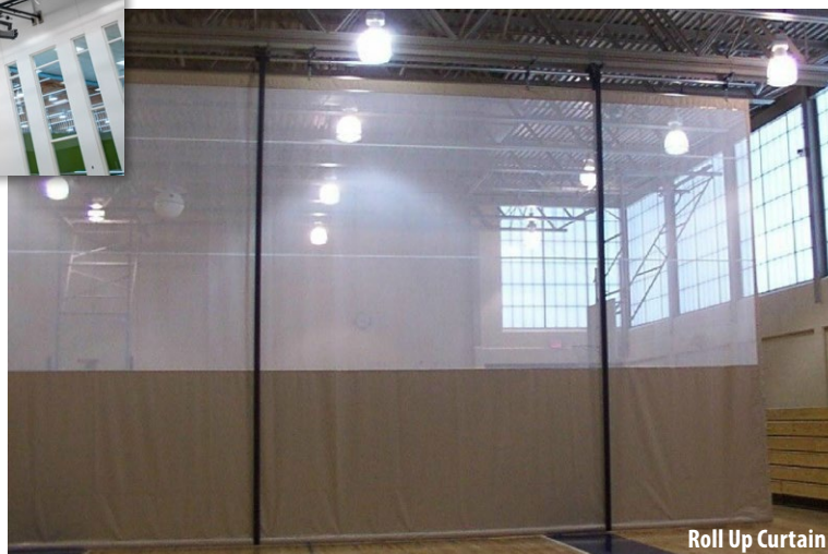
Roll Up Curtain