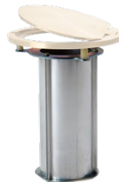
Aluminum Floor Socket

Folds flat for transport and storage. Gray padding coordinates with platform finish.