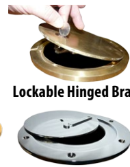
Lockable Hinged Brass